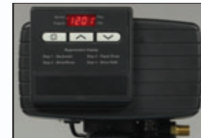
Advanced SE Electronic Timer