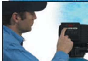
Installing the Fleck 5600 softener system can save significant amounts of water and salt.

The 5600 control valve has been engineered and tested to withstand the equivalent of 27 years of uninterrupted daily use.